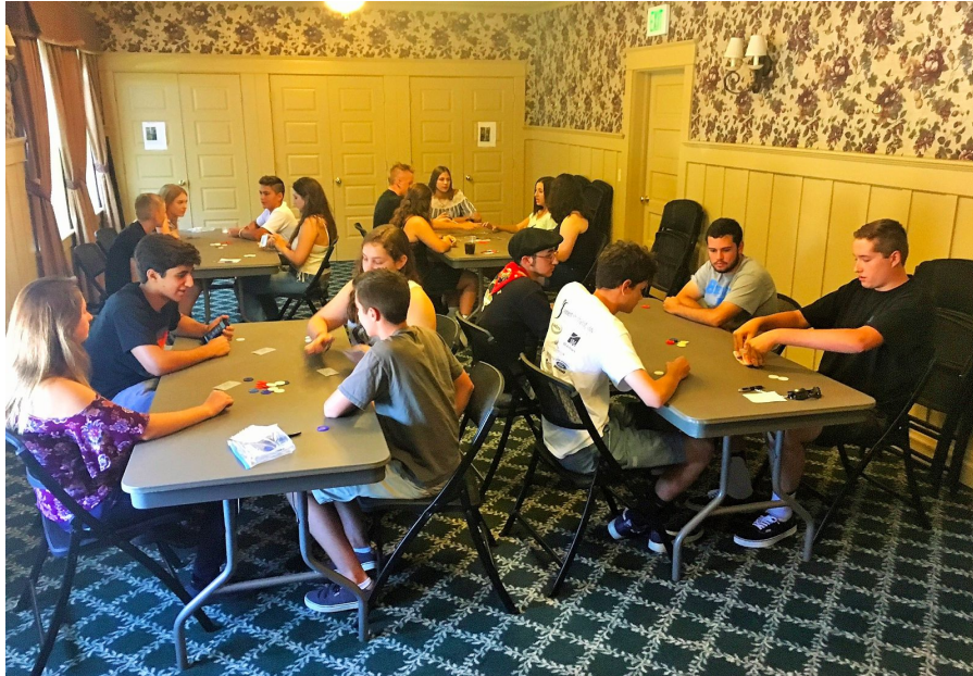
Junior Mus Tournament, Gardnerville, Nevada 2017

Delegates, If you don't know who in your club is in charge of Junior Mus – then tag, it's you! :) Please provide me with a contact person in your club.